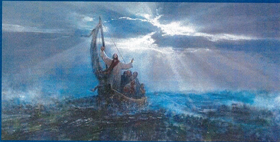
St. Jude Catholic Church & The Shrine of the Infant Jesus of Prague Parish Weekly Update as of June 19, 2021.