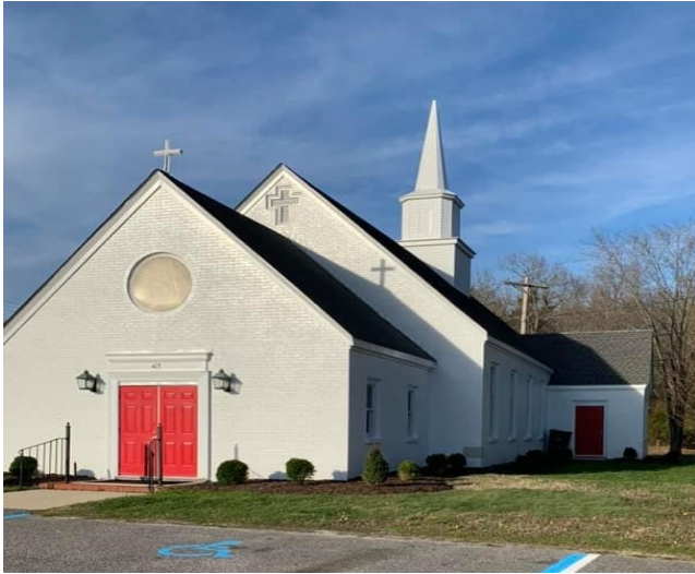
The Shrine of the Infant Jesus of Prague HWY 460, Wakefield, VA. 23888