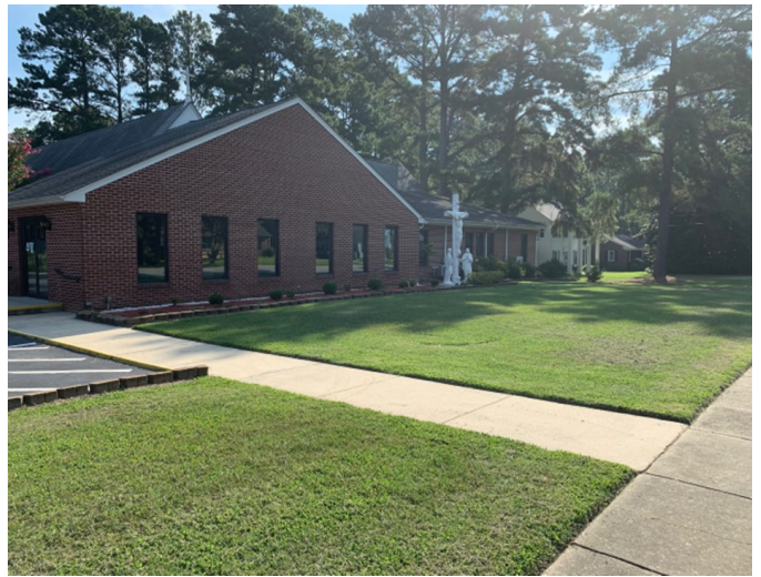
St. Jude Catholic Church 1014 Clay St., Franklin, VA. 23851

Office: (757)569-9600 www.stjudefranklin.org Fax: (757)304-9338