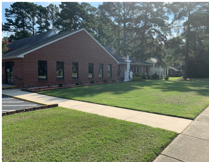
St. Jude Catholic Church 1014 Clay St., Franklin, VA. 23851

Office: (757)569-9600 www.stjudefranklin.org Fax: (757)304-9338