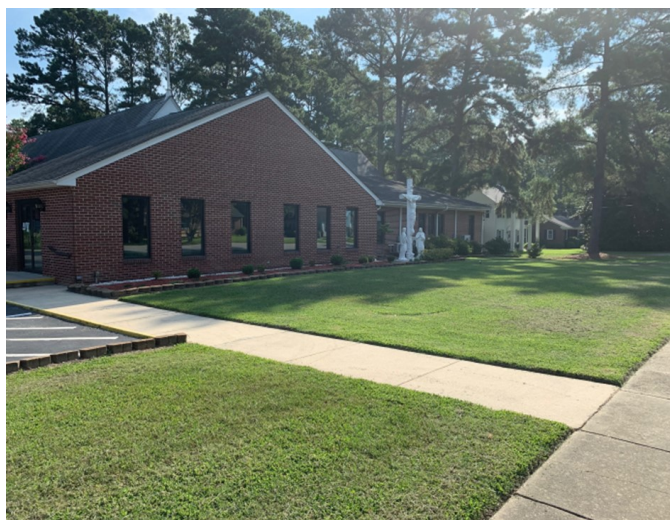
St. Jude Catholic Church 1014 Clay St., Franklin, VA. 23851

Office: (757)569-9600 www.stjudefranklin.org Fax: (757)304-9338