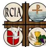
Rite of Christian Initiation for Adults

Please be generous in you contributions to help.