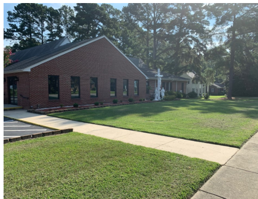
St. Jude Catholic Church 1014 Clay St., Franklin, VA. 23851

Office: (757)569-9600 www.stjudefranklin.org Fax: (757)304-9338