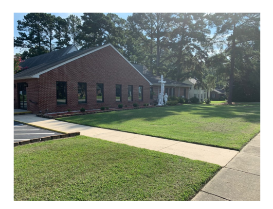
St. Jude Catholic Church 1014 Clay St., Franklin, VA. 23851

Office: (757)569-9600 www.stjudefranklin.org Fax: (757)304-9338