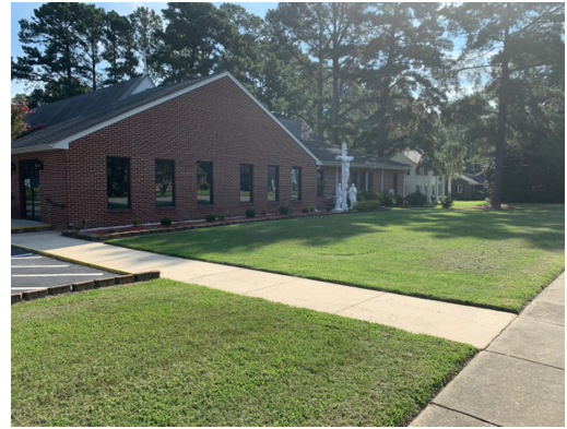
St. Jude Catholic Church 1014 Clay St., Franklin, VA 23851

Office: (757)569-9600 www.stjudefranklin.org Fax: (757)304-9338