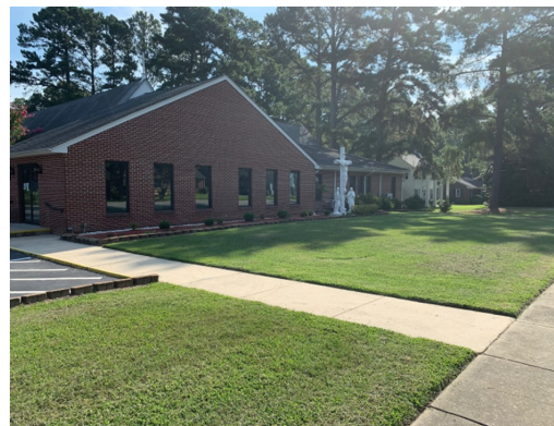
St. Jude Catholic Church 1014 Clay St., Franklin, VA 23851

Office: (757)569-9600 www.stjudefranklin.org Fax: (757)304-9338