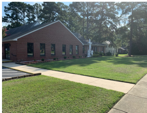
St. Jude Catholic Church 1014 Clay St., Franklin, VA 23851

Office: (757)569-9600 www.stjudefranklin.org Fax: (757)304-9338