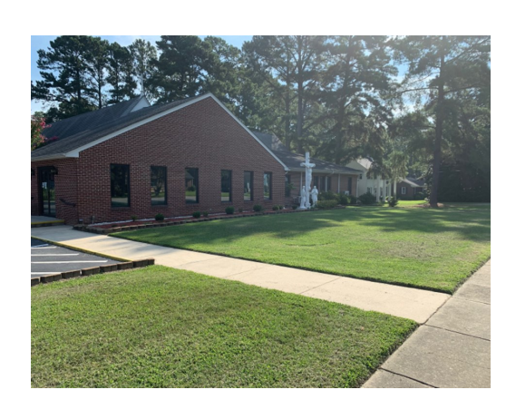
St. Jude Catholic Church 1014 Clay St., Franklin, VA 23851

Office: (757)569-9600 www.stjudefranklin.org Fax: (757)304-9338