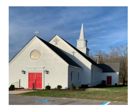
The Shrine of the Infant Jesus of Prague 417 N. County Drive, Wakefield, VA 23888