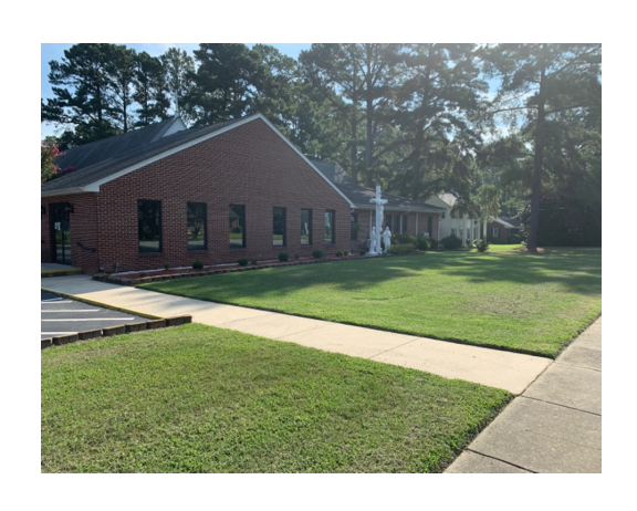
St. Jude Catholic Church 1014 Clay St., Franklin, VA 23851

Office: (757)569-9600 www.stjudefranklin.org Fax: (757)304-9338