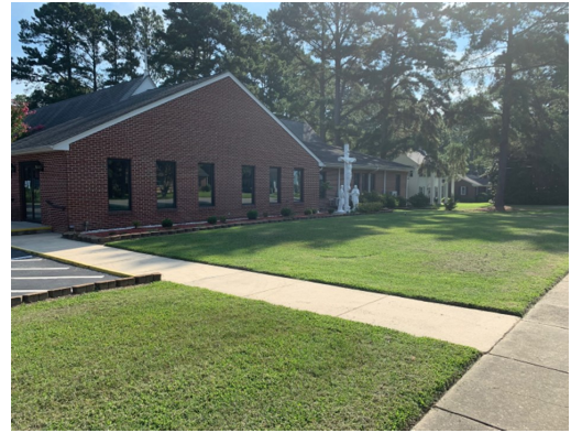
St. Jude Catholic Church 1014 Clay St., Franklin, VA 23851

Office: (757)569-9600 www.stjudefranklin.org Fax: (757)304-9338