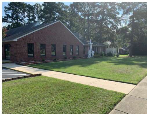
St. Jude Catholic Church 1014 Clay St., Franklin, VA 23851

Office: (757)569-9600 www.stjudefranklin.org Fax: (757)304-9338