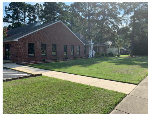
St. Jude Catholic Church 1014 Clay St., Franklin, VA 23851

Office: (757)569-9600 www.stjudefranklin.org Fax: (757)304-9338