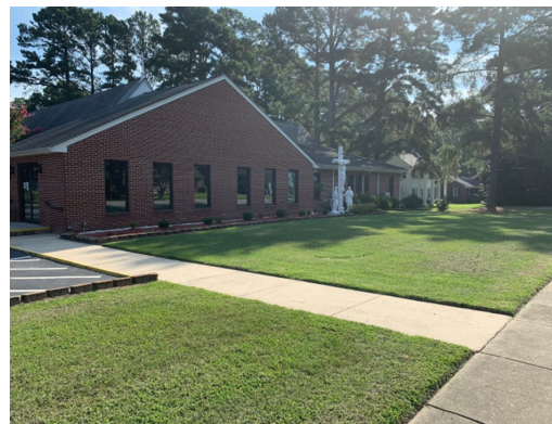
St. Jude Catholic Church 1014 Clay St., Franklin, VA 23851

Office: (757)569-9600 www.stjudefranklin.org Fax: (757)304-9338