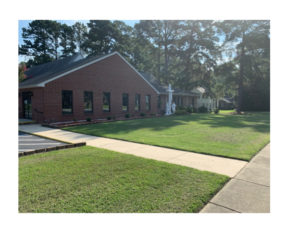
St. Jude Catholic Church 1014 Clay St., Franklin, VA 23851

Office: (757)569-9600 www.stjudefranklin.org Fax: (757)304-9338