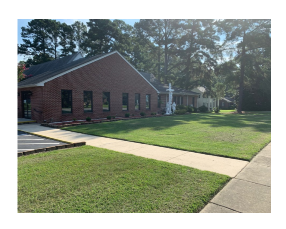
St. Jude Catholic Church 1014 Clay St., Franklin, VA 23851

Office: (757)569-9600 www.stjudefranklin.org Fax: (757)304-9338