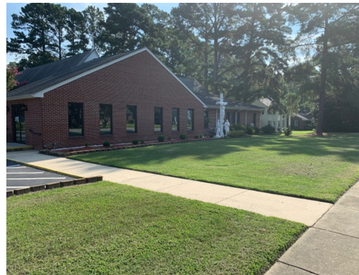
St. Jude Catholic Church 1014 Clay St., Franklin, VA 23851

Office: (757)569-9600 www.stjudefranklin.org Fax: (757)304-9338