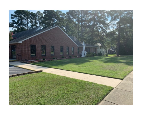
St. Jude Catholic Church 1014 Clay St., Franklin, VA 23851

Office: (757)569-9600 www.stjudefranklin.org Fax: (757)304-9338