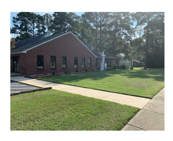
St. Jude Catholic Church 1014 Clay St., Franklin, VA 23851

Office: (757)569-9600 www.stjudefranklin.org Fax: (757)304-9338