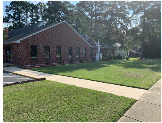
St. Jude Catholic Church 1014 Clay St., Franklin, VA 23851

Office: (757)569-9600 www.stjudefranklin.org Fax: (757)304-9338